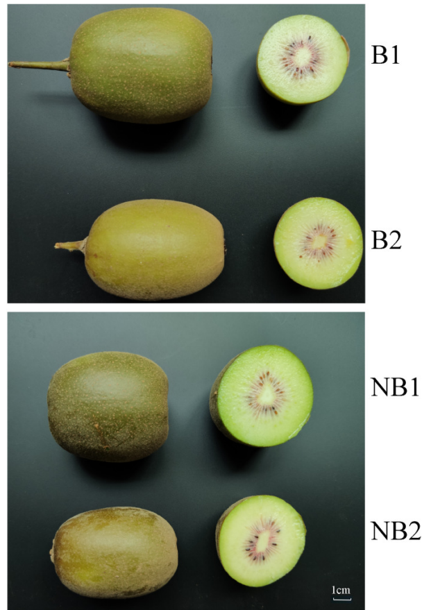
Figure 1. Bagging treatment of 'Donghong' kiwifruit phenotype

As shown in Figure 1 and Table 2, the pulp of these four treated groups is sweet, with a lot of juice. The shape of the fruit is regular and beautiful, with the fruit core is bright red, as the sun radiates around. Since belongs to the dark green hairless variety, the overall fruit surface of 'Donghong' is smoother. After bagging, the pericarp color of 'Donghong' is lighter than NB group, and the color is more uniform, without spots and scabs. Meanwhile, the ripening fruit of bagging group are sweeter, with the lower acidity. After the treatment of pesticides, the fruit is significantly larger and tends to be short and round, with the deeper color and cleaner fruit surface. However, there is no significant difference in the taste of fruits.