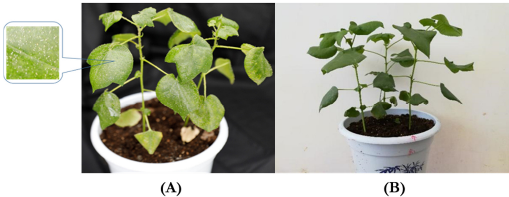
Figure 2. This figure shows respectively aphid infested plants and healthy plants at the same environment (A) The cotton plants covered with nylon mesh are infested by cotton aphid, and aphids distributed throughout the plant, aphids include winged aphids and wingless aphids; (B) The cotton plants covered with nylon mesh are healthy and keep away from inoculated plants.